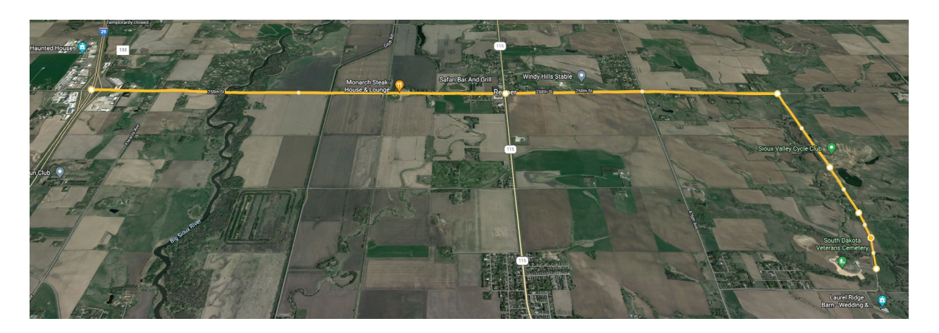
Traveling northbound or southbound on I-29: Take exit 86. Travel eastbound on 258<sup>th</sup> St. Traveling eastbound turn right at 477<sup>th</sup> Ave. (South). Follow 477<sup>th</sup> Ave. until you reach the entrance of the South Dakota Veterans Cemetery to your right.