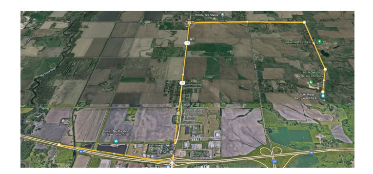
Traveling I-90 eastbound: Take exit 399. Stay left. Travel northbound on Cliff Ave. to 258<sup>th</sup> St. At the intersection turn right (east) on 258<sup>th</sup> St. Traveling eastbound turn right at 477<sup>th</sup> Ave. (South). Follow 477<sup>th</sup> Ave. until you reach the entrance of the South Dakota Veterans Cemetery to your right.